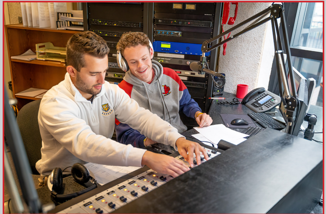
Winter Term, 2020

Marvins Teachers Credit Union Old National Bank Prindle Institute for Ethics Don Julios Hendershot' Service Center Neal Tire Dairy Castle DePauw Student Affairs 3D Tire Eli's Books Wasser Brewing Company Scoops Ice Cream Almost Home Charlie's Beefcake Burgers