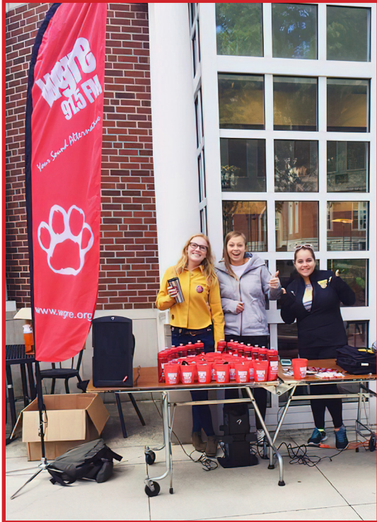
College Radio Day, 2015